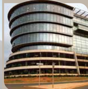
Illovo Building Kwazulu-Natal