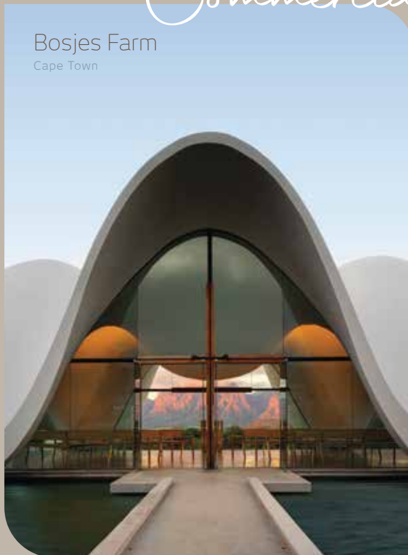
Bosjes Farm Cape Town

We strive to deliver an end-to-end service of the highest quality, with expert advice, design ideation, insightful product selection and site visits. We are passionate about our products and we love what we do.