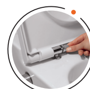
REMOVABLE SEAT & COVER