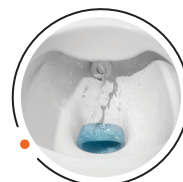
SURFACE FINISH LCC & RIMLESS

Special suitable for public buildings, hospitals but also in private houses or hotels for more hygiene and efficiency