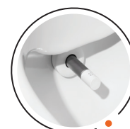
HYGIENIC & EASILY REPLACEABLE HEAD & COVER RING